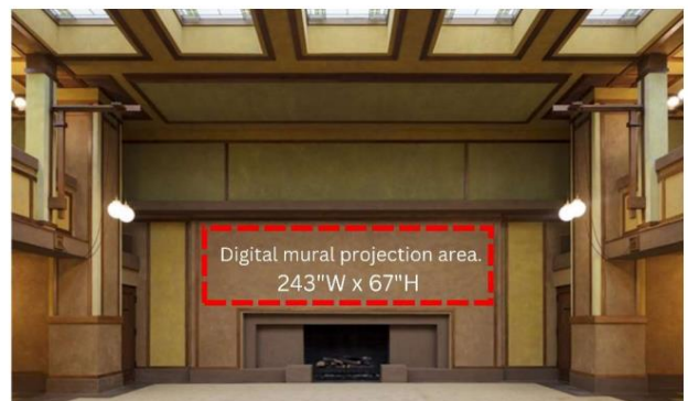
View of fireplace in Unity House